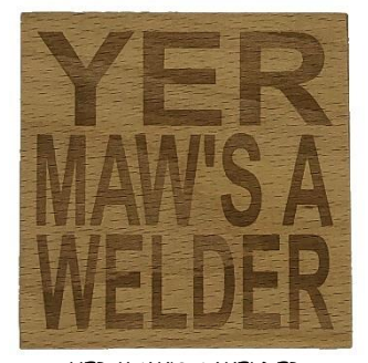
YER MAW'S A WELDER CO1-013-A