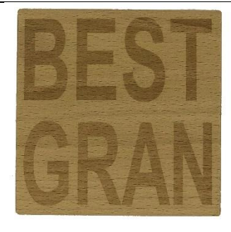
BEST GRAN CO1-004-F