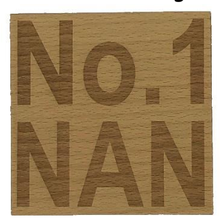
No. 1 NAN CO1-004-C