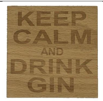
KEEP CALM AND DRINK GIN CO1-009-C