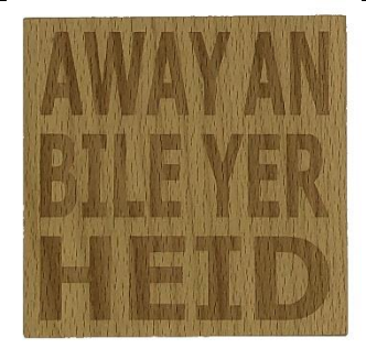
AWAY AN BILE YER HEID CO1-003-A