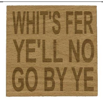
WHIT'S FER YE'LL NO GO BY YE CO1-003-W