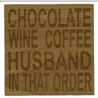
A WIFE'S PRIORITIES CO1-008-C