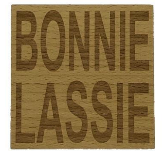
BONNIE LASSIE CO1-006-A