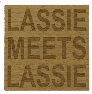
LASSIE MEETS LASSIE CO1-006-E