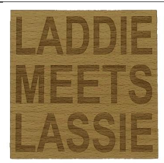
LADDIE MEETS LASSIE CO1-006-D