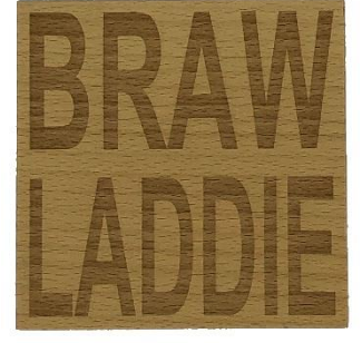
BRAW LADDIE CO1-006-B