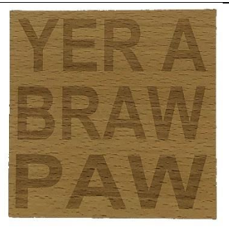
YER A BRAW PAW CO1-005-C