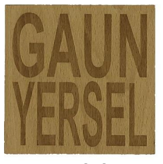
GAUN YERSEL CO1-003-B