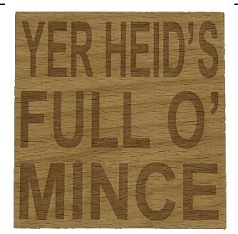
YER HEID'S FULL O' MINCE CO1-003-S