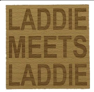
LADDIE MEETS LADDIE CO1-006-C