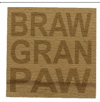
BRAW GRAN PAW CO1-005-D