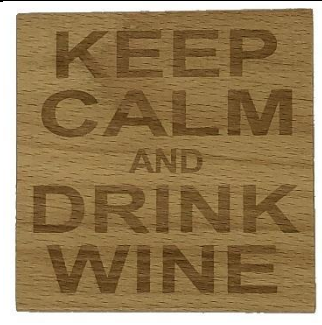
KEEP CALM AND DRINK WINE CO1-009-F