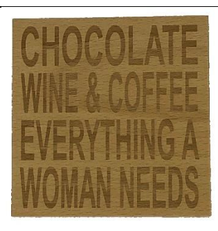
EVERYTHING A WOMAN NEEDS CO1-008-B