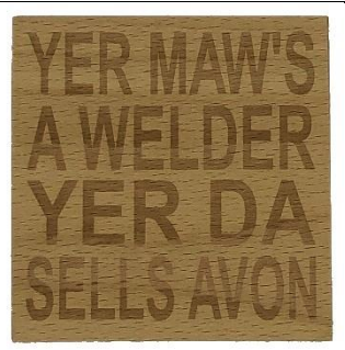
YER MAW YER DA CO1-013-C