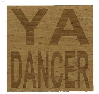
YA DANCER CO1-003-R