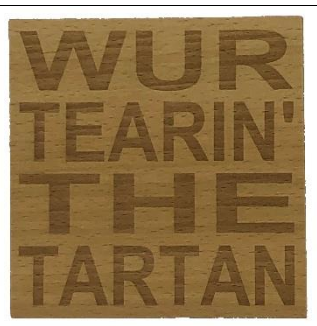
WUR TEARIN' THE TARTAN CO1-003-Q