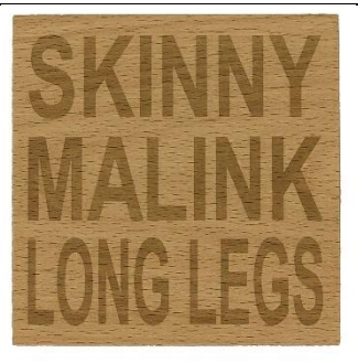
SKINNY MALINK LONG LEGS CO1-003-V