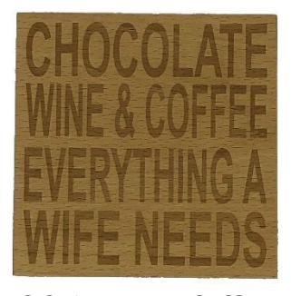
EVERYTHING A WIFE NEEDS CO1-008-A