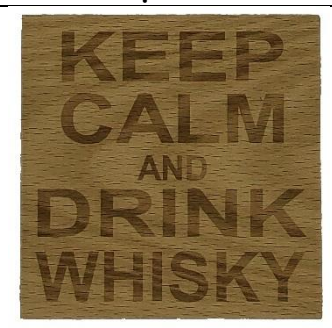
KEEP CALM AND DRINK WHISKY CO1-009-H