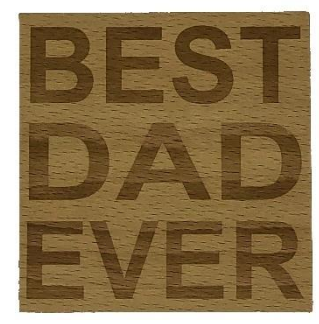
BEST DAD EVER CO1-005-A