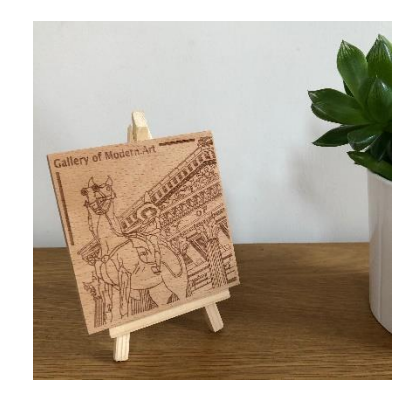
COASTERS - INDIVIDUAL