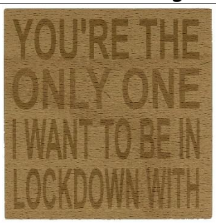
YOU'RE THE ONLY ONE CO1-006-G