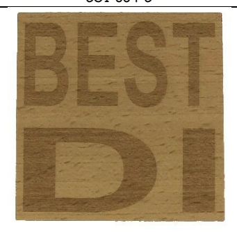
BEST DI CO1-005-E