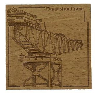
GLASGOW FINNESTON CRANE CO1-007-E