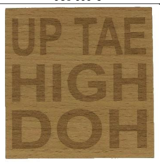
UP TAE HIGH DOH CO1-003-AA