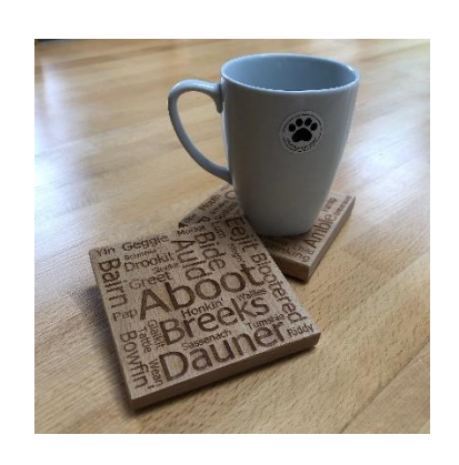
COASTERS - SETS OF 4