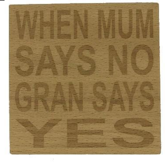
WHEN MUM SAY NO GRAN SAYS YES CO1-004-E