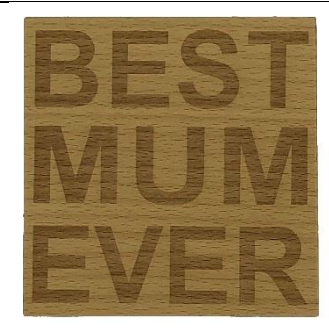
BEST MUM EVER CO1-004-A