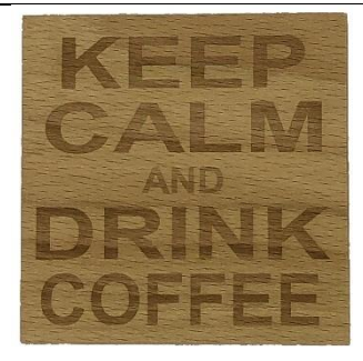
KEEP CALM AND DRINK COFFEE CO1-009-B