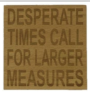
DESPERATE TIMES CO1-010-A