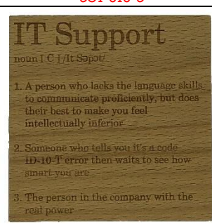
IT SUPPORT CO1-018-D