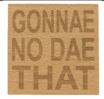
GONNAE NO DAE THAT CO1-003-Y