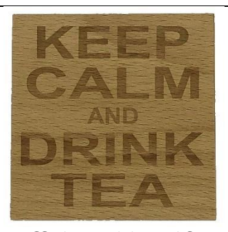
KEEP CALM AND DRINK TEA CO1-009-D