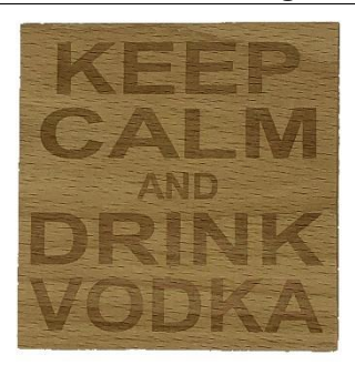
KEEP CALM AND DRINK VODKA CO1-009-E