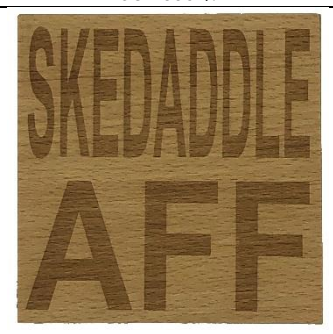
SKEDADDLE AFF CO1-003-N