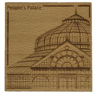
GLASGOW PEOPLE'S PALACE CO1-007-F