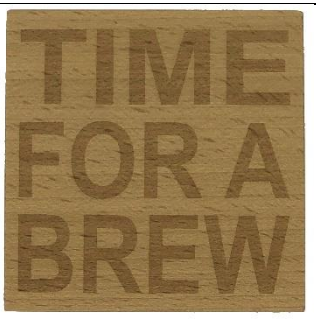
TIME FOR A BREW CO1-010-B