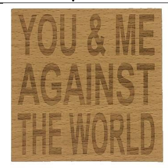
YOU & ME AGAINST THE WORLD CO1-008-E