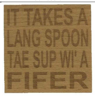
IT TAKES A LANG SPOON TAE SUP WI A FIFER CO1-003-Z