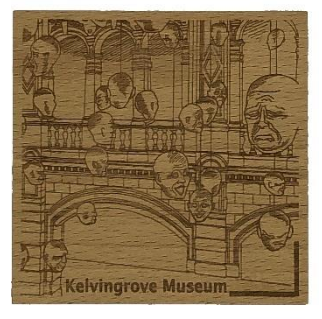
GLASGOW KELVINGROVE MUSEUM CO1-007-H