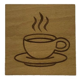
TEA CUP CO1-001-B