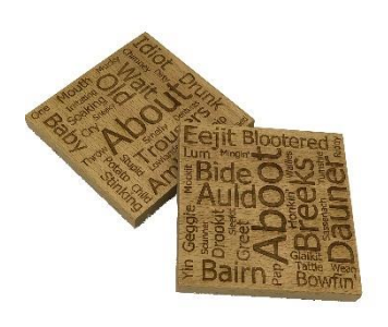
SCOTS / ENGLISH - SET OF 4 CO4-005-A (2 EACH OF CO1-002-A & B)