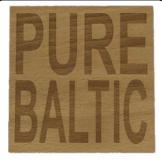
PURE BALTIC CO1-003-K