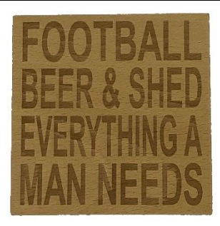
EVERYTHING A MAN NEEDS CO1-008-D