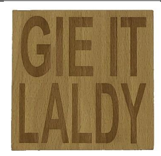
GIE IT LALDY CO1-003-C