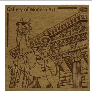
GLASGOW GALLERY OF MODERN ART CO1-007-A