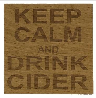
KEEP CALM AND DRINK CIDER CO1-009-J