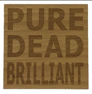
PURE DEAD BRILLIANT CO1-003-M