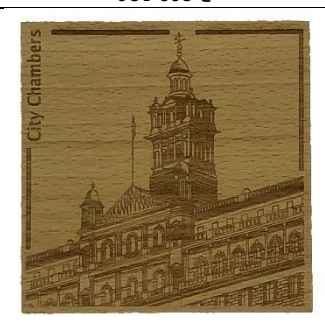
GLASGOW CITY CHAMBERS CO1-007-D