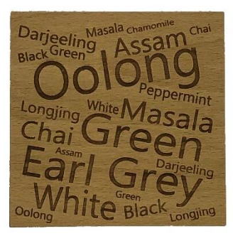
TEA VARIETIES CO1-001-D