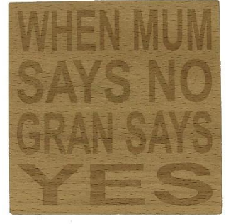
WHEN MUM SAY NO GRAN SAYS YES CO1-004-E