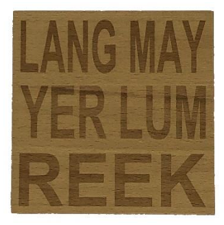
LANG MAY YER LUM REEK CO1-003-F