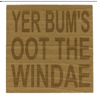
YER BUM'S OOT THE WINDAE Co1-003-X