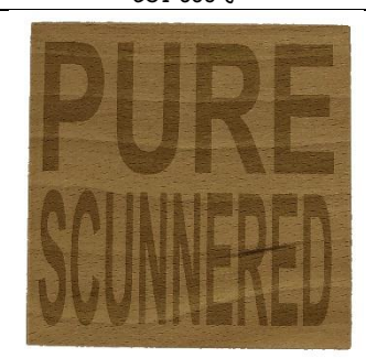
PURE SCUNNERED CO1-003-U