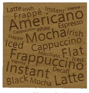
COFFEE VARIETIES CO1-001-C