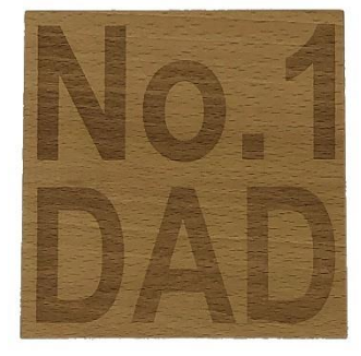
No. 1 DAD CO1-005-B