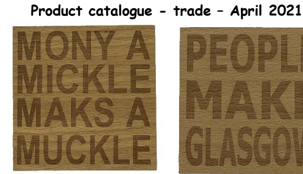
MONY A MICKLE MAKS A MUCKLE CO1-003-H