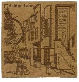
GLASGOW ASHTON LANE CO1-007-B