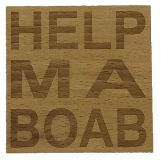
HELP MA BOAB CO1-003-E