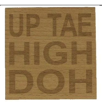
UP TAE HIGH DOH CO1-003-AA