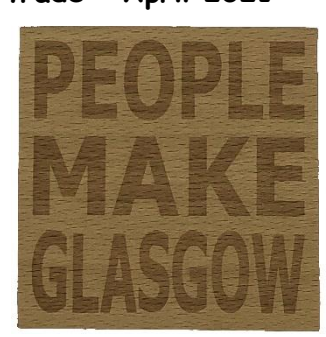
PEOPLE MAKE GLASGOW CO1-003-J