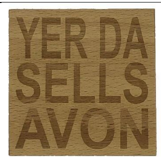
YER DA SELLS AVON CO1-013-B