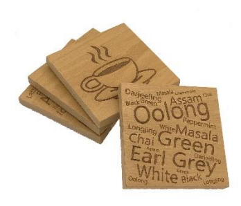
COFFEE / TEAS - SET OF 4 CO4-004-A (1 EACH OF CO1-001-A B C D)

Handmade wooden pallet coasters - set of 4