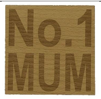
NO. 1 MUM CO1-004-B