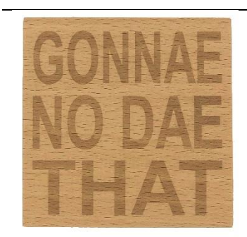
GONNAE NO DAE THAT CO1-003-Y