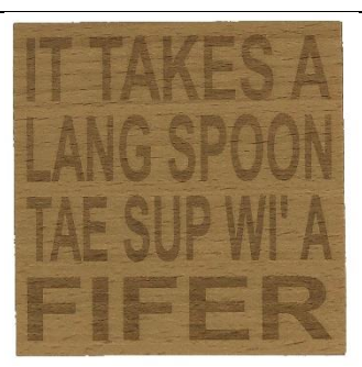
IT TAKES A LANG SPOON TAE SUP WI A FIFER CO1-003-Z