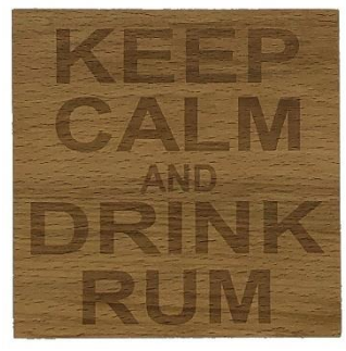
KEEP CALM AND DRINK RUM CO1-009-G