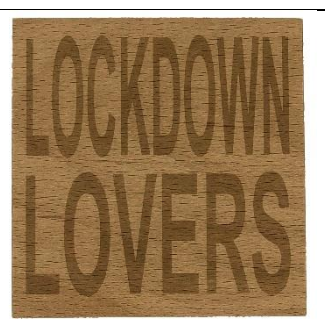
LOCKDOWN LOVERS CO1-006-F