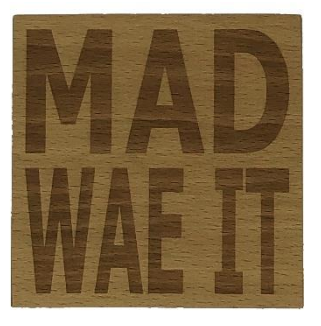
MAD WAE IT CO1-003-G