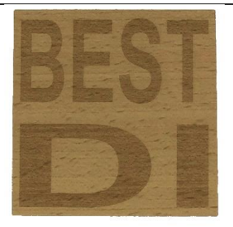
BEST DI CO1-005-E