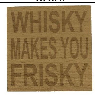
WHISKY MAKES YOU FRISKY CO1-010-C