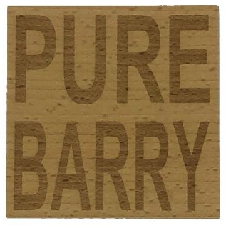
PURE BARRY CO1-003-L