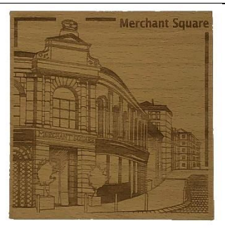
GLASGOW MERCHANT SQUARE CO1-007-C