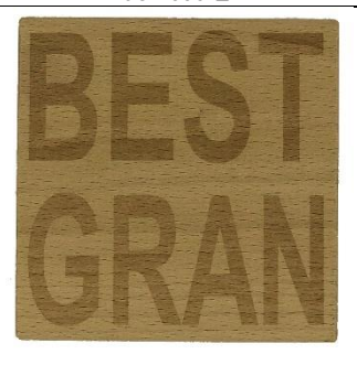
BEST GRAN CO1-004-F