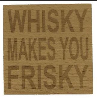
WHISKY MAKES YOU FRISKY CO1-010-C

New products are included in the relevant sections and order form, highlighted in red for clarity.