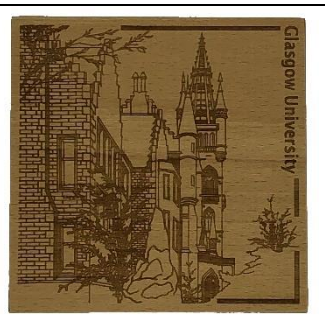
GLASGOW UNIVERSITY CO1-007-G