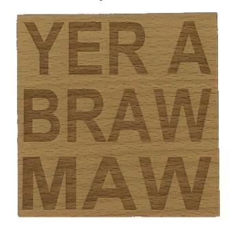
YER A BRAW MAW CO1-004-D