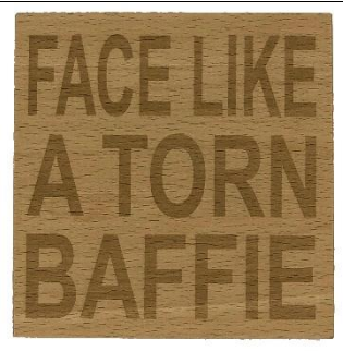
FACE LIKE A TORN BAFFIE CO1-003-U