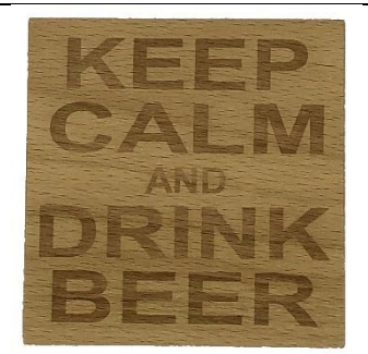
KEEP CALM AND DRINK BEER CO1-009-A