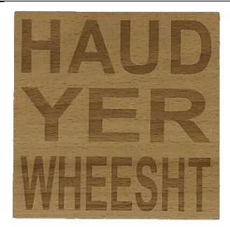
HAUD YER WHEESHT CO1-003-D