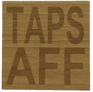
TAPS AFF CO1-003-P